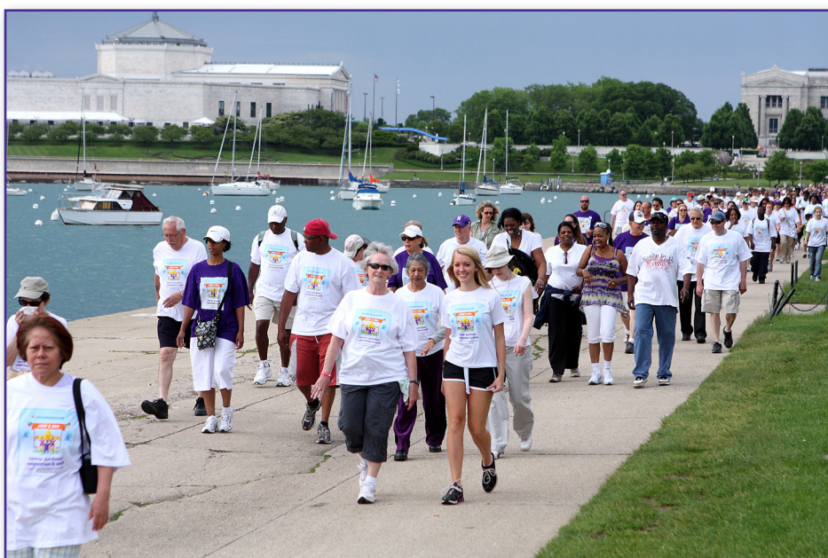
Cancer Survivors' Celebration & Walk

THE 18TH ANNUAL CANCER SURVIVORS' CELEBRATION & WALK was a record-breaking event in more ways than one! Close to 4,000 cancer survivors, friends, family members and caregivers—more than ever before-- took part in the event on National Cancer Survivors Day, Sunday, June 5th.