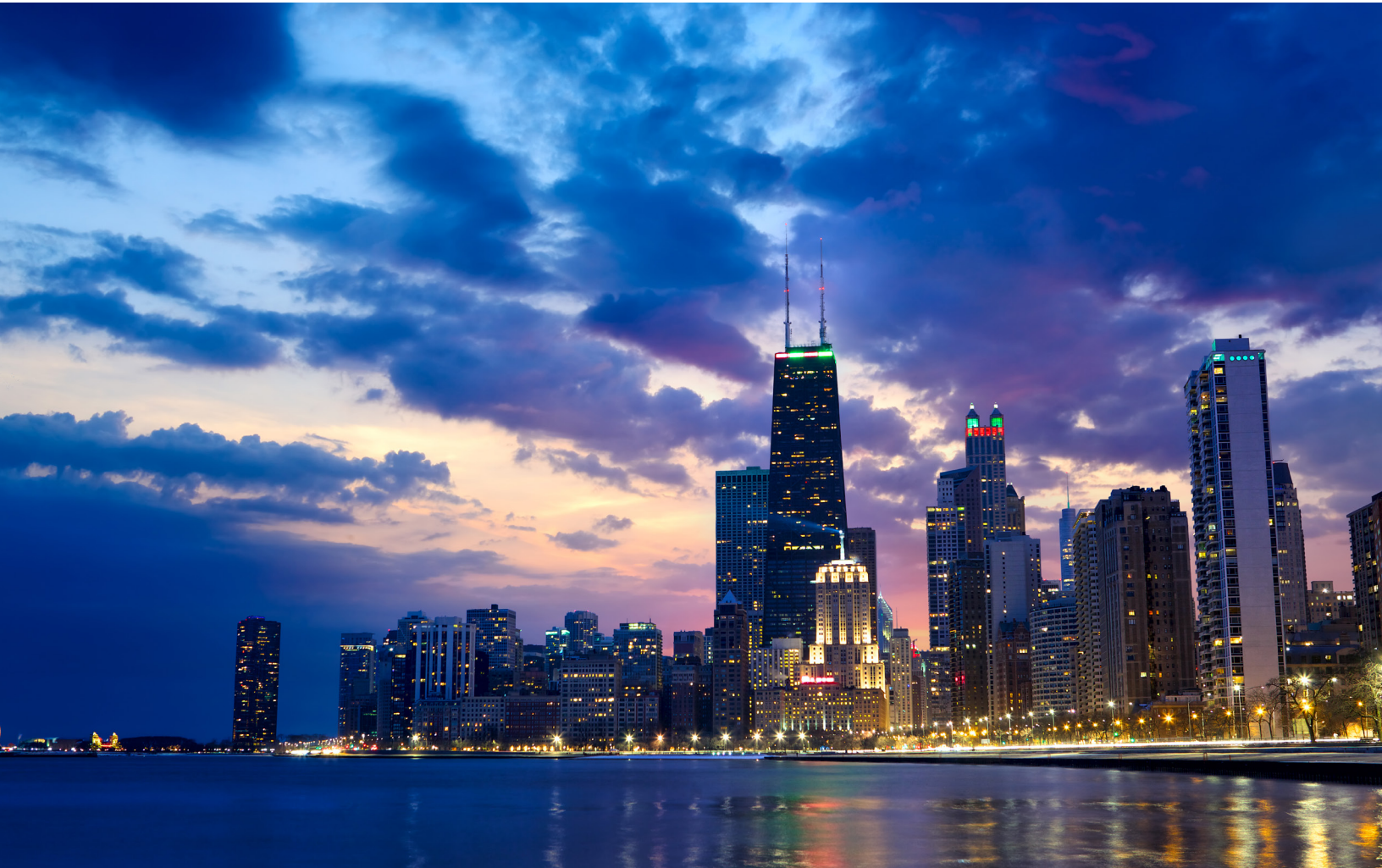
Exhibit & Sponsorship Information Packet